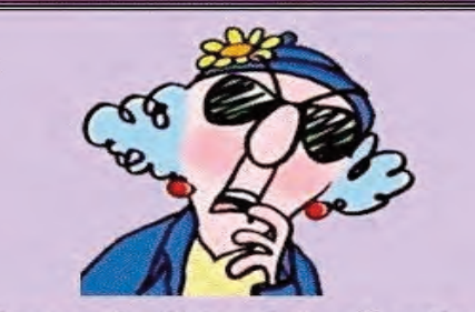
Instead of the John I call my bathroom the Jim! That way it sounds better when I say I go to the Jim first thing every morning!!!